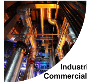
Industrial & Commercial