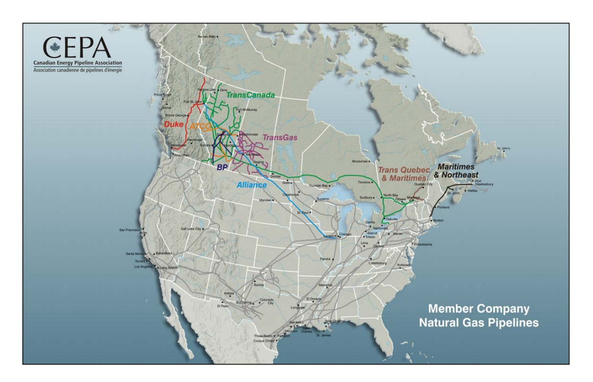
Figure 2: Canada's major gas pipelines.