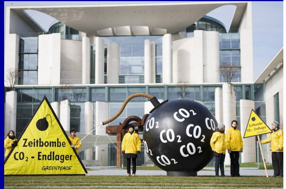
Chancellery, Berlin, 25 March, 2009